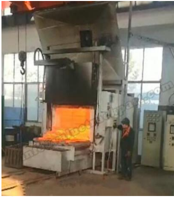
< Overall Hardening & Tempering